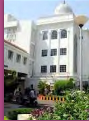
SALAR JUNG MUSEUM

Housing the largest one-man collection of antiques in the world, the Salar Jung Museum encompasses global artefacts dating back centuries. The Museum was established in 1951. Situated on the southern bank of the river Musi, the Salar Jung Museum is not far from the other important monuments of the old city. Salar Jung Museum is a repository of the artistic achievements of diverse European, Asian and Far Eastern countries of the world. The major portion of this collection was acquired by Nawab Mir Yousuf Ali Khan popularly known as Salar Jung III. The zeal for acquiring art objects continued as a family tradition for three generations of Salar Jungs.