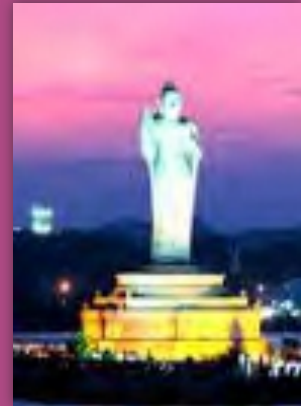
HUSSAIN SAGAR LAKE

One of the biggest man-made lakes is situated at Hyderabad. Its uniqueness lies in the fact that it connects the twin cities of Hyd. and Secunderabad. A famous monolith of Lord Buddha is installed at the center of the lake. Hussain Sagar Lake is popularly known as the Tank Bund, a major spot of tourist attractions. The Hussain Sagar was constructed on a tributary of the Musi river by Hussain Shah Wali during the reign of Ibrahim Quli Qutub Shah in 1562. It is a sprawling artificial lake that holds water perennially. Every Sunday cultural programmes are conducted by the Department of culture in the evenings and admission is free for the public. Boating & Water Sports are a regular feature at Hussain Sagar.